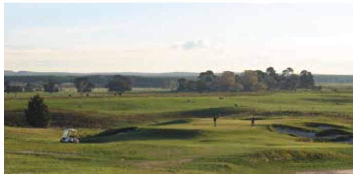
Mountain Views, gently undulating fairways and quick greens

Longford-Rosedale Road, LONGFORD Ph: (03) 5149 7230