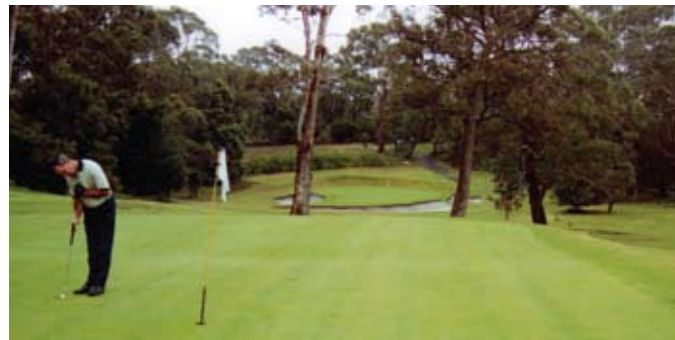
Picturesque course dry all year, renowned for kangaroos on course.

South Gippsland Highway, YARRAM (3kms east of Yarram) Ph: (03) 5182 5596