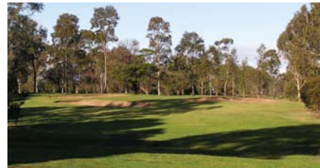
Excellent Greens, gently undulating fairways for an easy walk.

Fulton Road MAFFRA VIC 3860 Ph/Fax: (03) 5147 1884 • Email: maffragolf@vic.australis.com.au